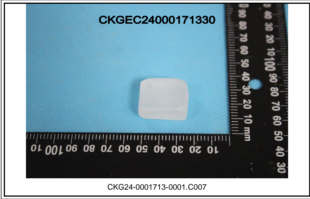
此照片仅限于随 SGS 正本报告使用 ***报告结束***